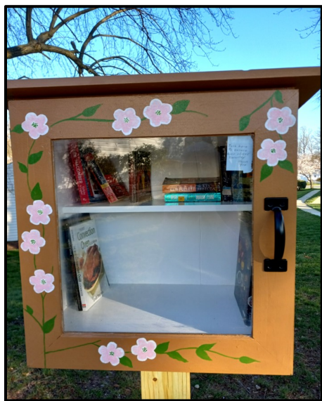
Close-up of one of the Birdhouse Library Boxes.

We hope you enjoy our new libraries and meet some “new friends” in the books you find there.